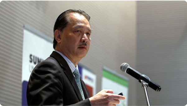
Friday, March 27, 2020 COVID-19: Another death reported, bringing the death toll to 24