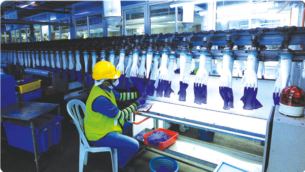
Thursday, December 24, 2020 Top KLCI gainers add RM108b to market cap

Dr Mahathir also called on Putrajaya to use all possible avenues to speed up the vaccination rate in the country, noting the increase of Covid-19 cases in the past few weeks, with only 3% of the population having been inoculated.