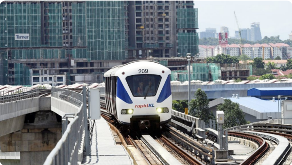
Wednesday, March 18, 2020 Rapid KL rail service to be revised effective March 20, due to COVID-19