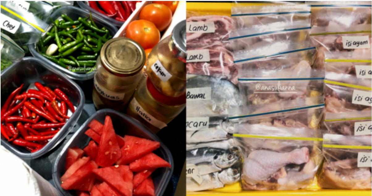
Here's How To Make Food Last Longer In The Fridge And Limit Grocery Trips