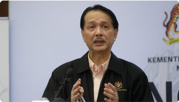
Monday, May 4, 2020 COVID-19: 55 new cases, no deaths – Health DG