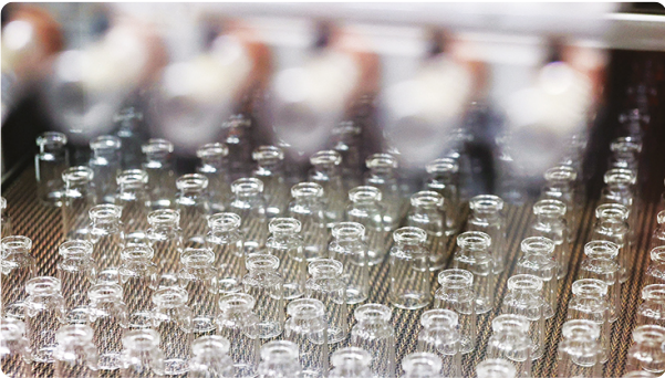
Monday, January 11, 2021 Bintai appoints cold chain box distributor for Covid vaccine