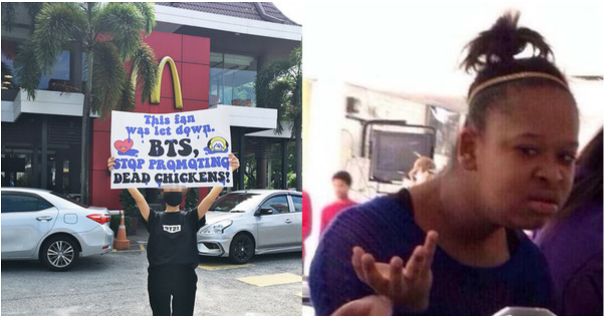
PETA Accuses BTS Of Promoting Animal Cruelty With McDonald's BTS Meal