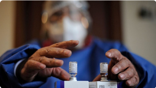
Monday, February 8, 2021 Putin’s once-scorned vaccine now favorite in pandemic fight